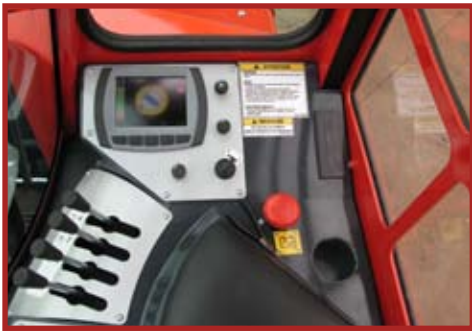
New Display Including Wheel Position