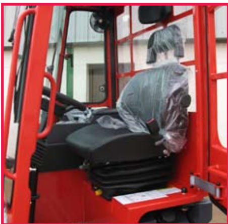
Deep Suspension Seat